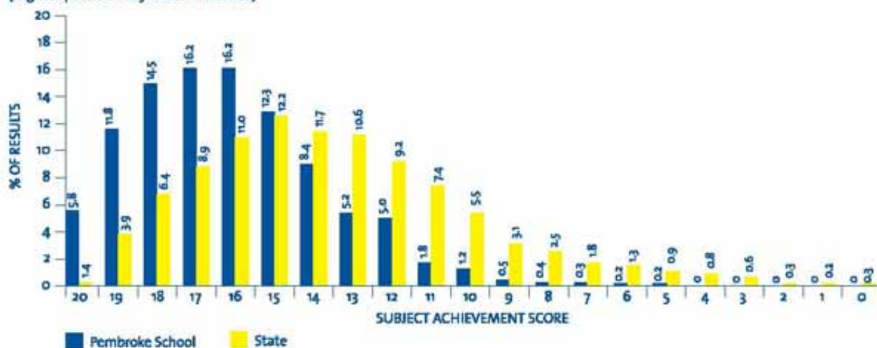
SACE ACHIEVEMENT SCORE SUMMARY 2006 Pembroke School and State results comparison (Highest possible subject score is 20/20)